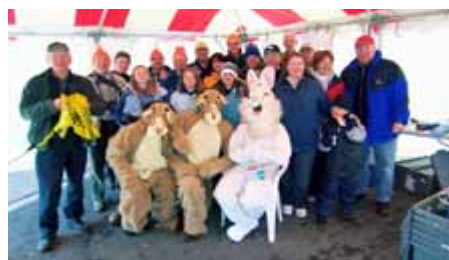
Egg Hunt 2008 — Aldershot Lions Club members.

We are always looking for new members to join our club – people who are interested in supporting the needs of the Burlington/Aldershot community, who like to meet new people and who enjoy getting involved. In return, we promise interesting challenges and the satisfaction of knowing you've made a difference in someone's life.