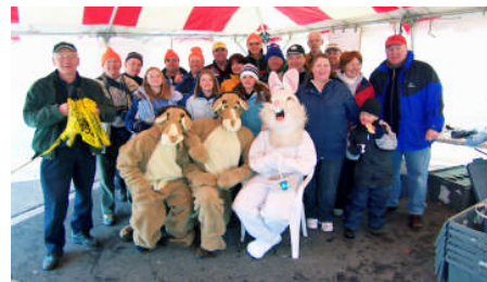
Egg Hunt 2008 — Aldershot Lions Club members.

We are always looking for new members to join our club – people who are interested in supporting the needs of the Burlington/Aldershot community, who like to meet new people and who enjoy getting involved. In return, we promise interesting challenges and the satisfaction of knowing you've made a difference in someone's life.